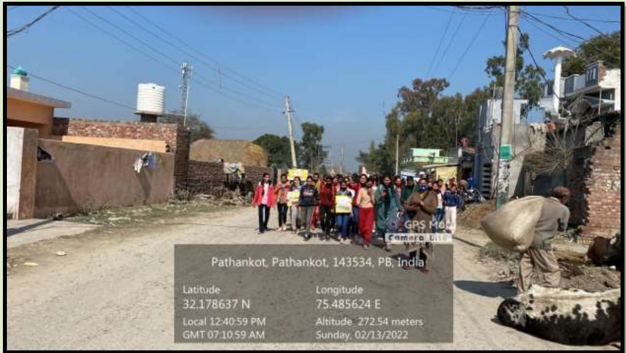
Rally Organized By Scince Department To Save Environment In Village Tangoshah in 2021-22