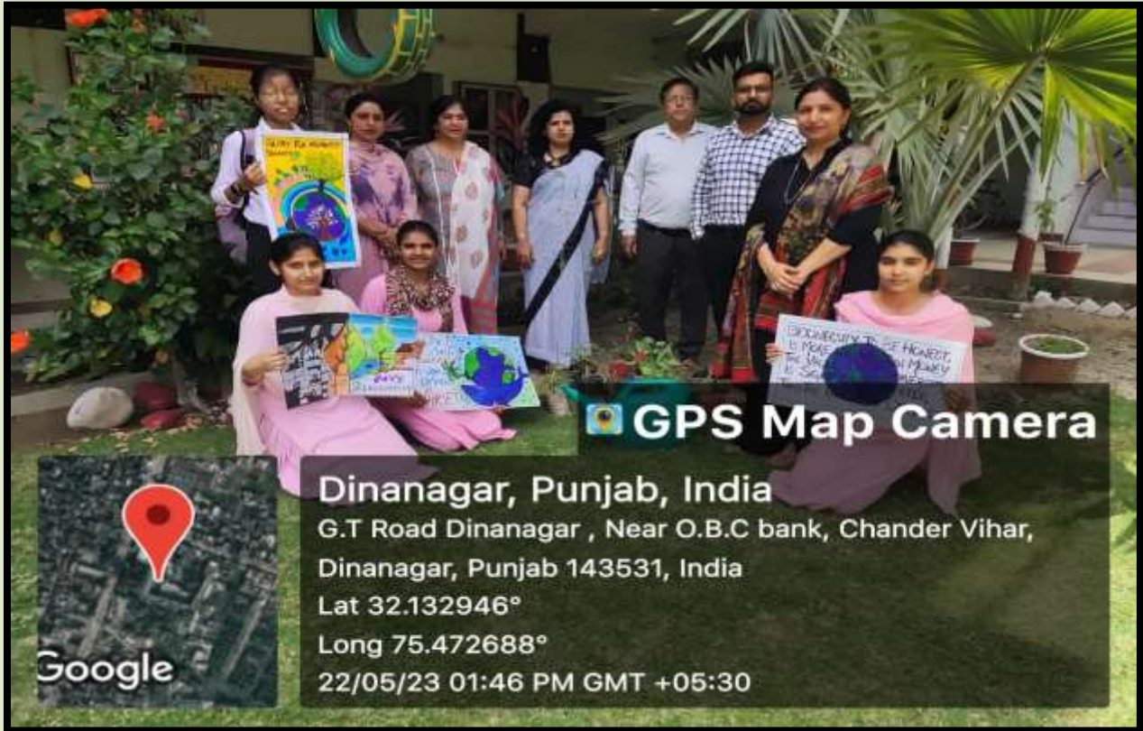
Tree Plantation Done At Campus To Celebrate World Environment Day In 2021-22