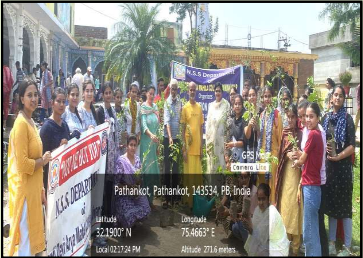
Tree Plantation Drive At Arya Math Dinanagar To celebrate Azadi Ka Amrit Mahotasav in 2022-23