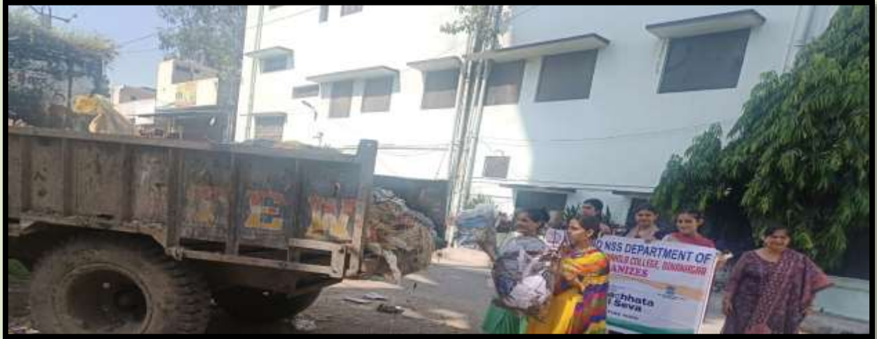
NSS Volunteers Maintaining Compost Pit Near The College