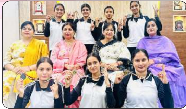
Overall First Position in District level Shooting competition at Khedan Vatan Punjab Diyan held at Tugalwala, Gurdaspur