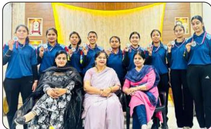
Won Overall 2nd Position in State level Dragon Boat Competition held at Roopnagar.