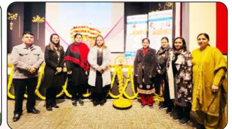
World Cancer Day