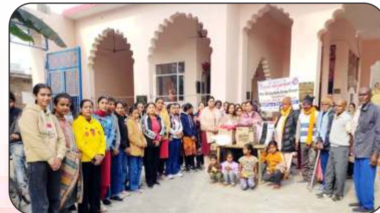
Eatables and Clothes Distributed to inmates of Kusht Asharam, Dinanagar