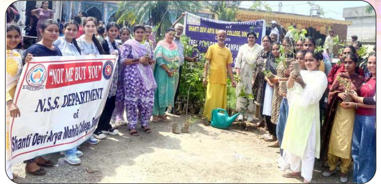
Tree Plantation Drive at Village Begowal