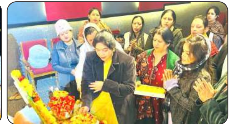
Akshat Vitran Samaroh