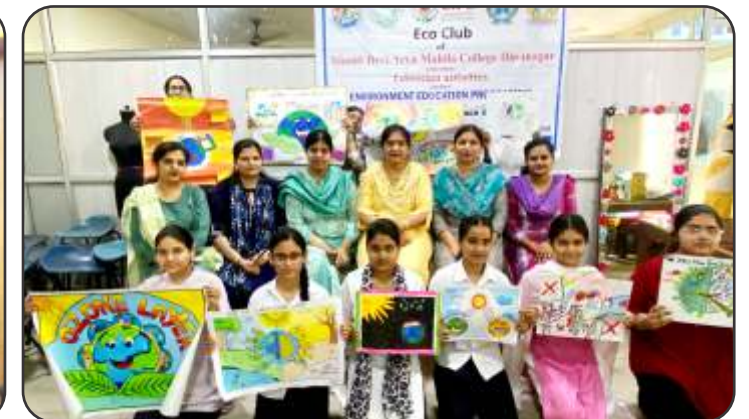
World Environment Day