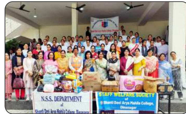
Ration kits, Fruits and Vegetables distributed in flood hit areas in Gurdaspur by the Institute.