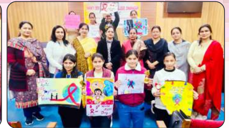
World AIDS Day