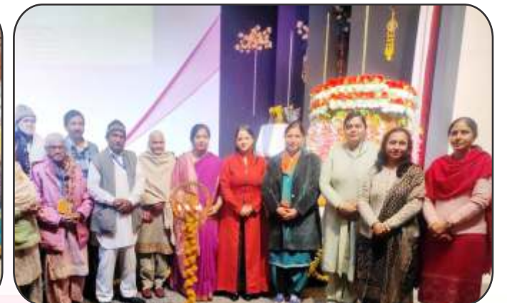
Inmates of Old age Home Babri invited in college on Christmas Eve