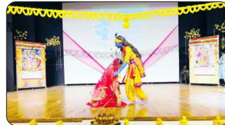
Sri Krishna Janmashtami Celebration