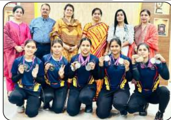
Overall 2nd position in State level Rowing Competition held at Khedan Vatan Punjab Diyan