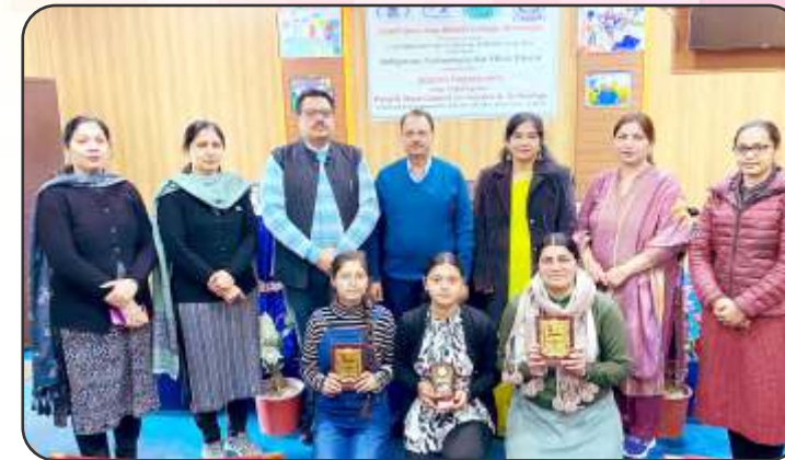
National Science Day