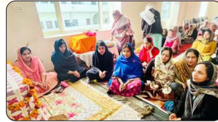
(Path) Guru Purav