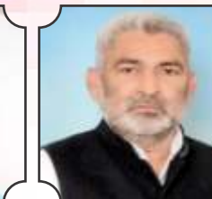
Mr. Lal Chand Kataruchakk Member of the Legislative Assembly of Punjab