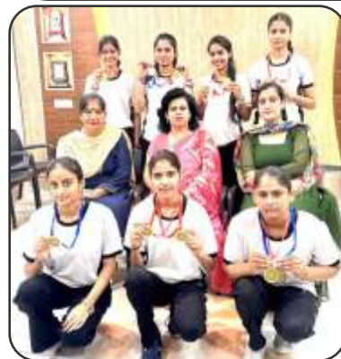
Won 2nd Position in Fencing Competition at Khedan Vatan Punjab Diyan held at Govt. Girls Sr. Sec. School, Gurdaspur