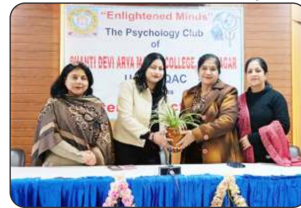
World Thinking Day