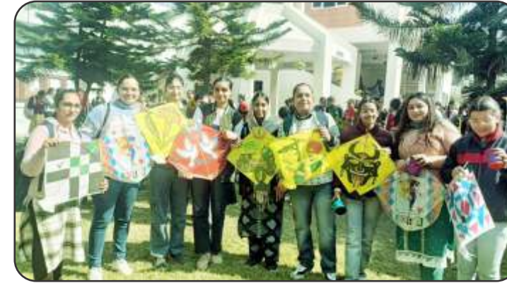
Basant Panchmi Celebration