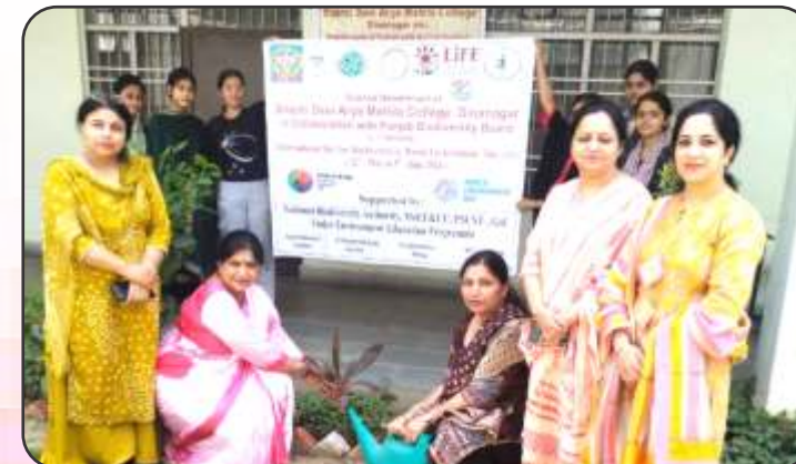
International Biodiversity Day