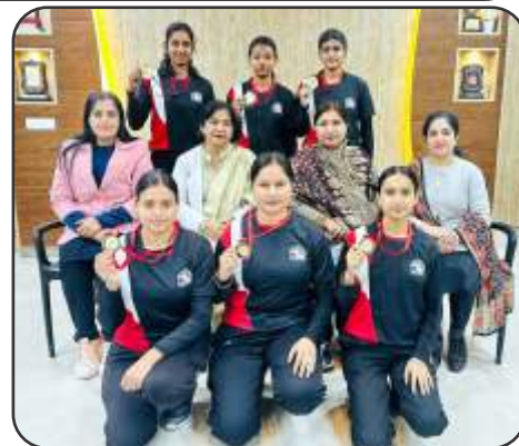
Won Overall 2nd Position in Inter College Shooting Competition held at Khalsa College, Amritsar.