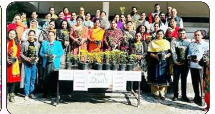
Green Diwali Celebration