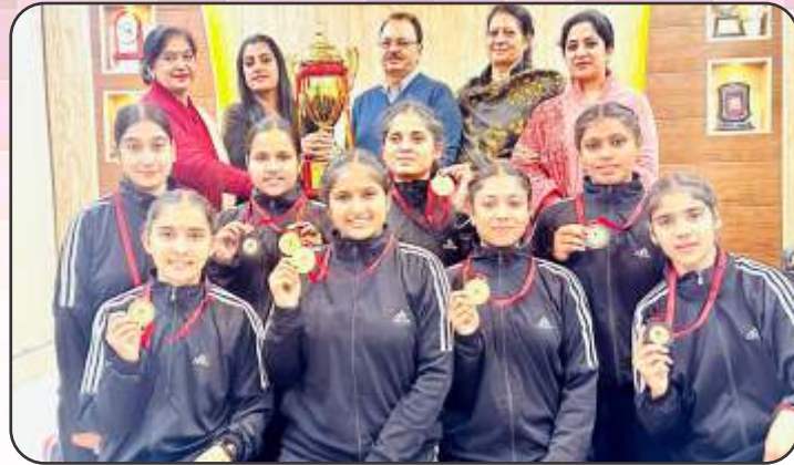
Won Champions Trophy in Inter College Rowing competition held at Dhaar Kalan, Pathankot