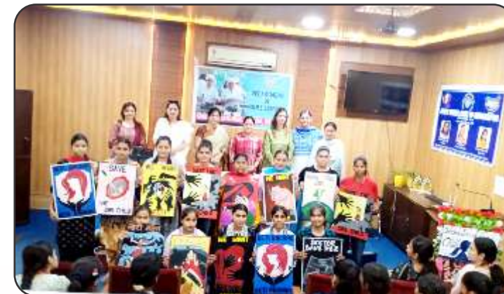
National Girl Child Day