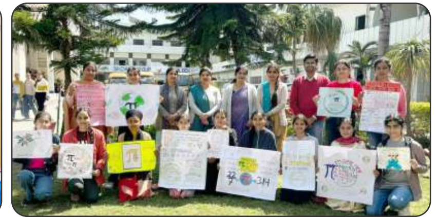
National Mathematics Day