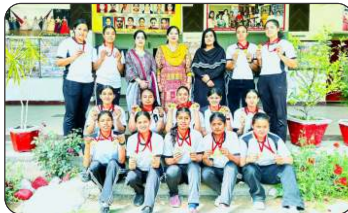
Won Overall 2nd Position in Inter College Dragon Boat Competition held at Dhaar Kalan, Pathankot