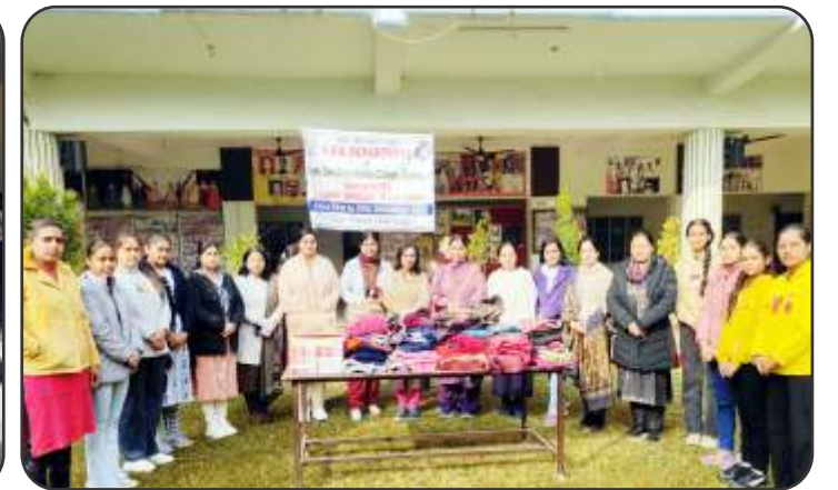
Clothes collected by Students and Staff Members for Distribution in Slum Areas near Awankha Village