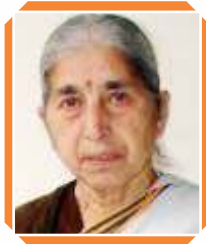
Prof. Laxmi Kanta Chawla Former Cabinet Minister, Punjab Government