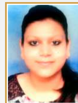
Krishna PGGC & FD Sem-II 6th in GNDU